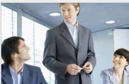
Open plan offices