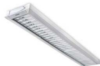
TCS 306 1xTL-D36W