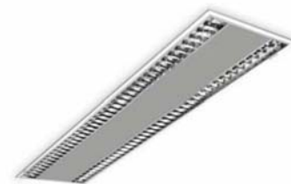
TBS 869 / 228 D8 HF

Sereno luminaires offer the latest technology for high comfort and optical efficiency in a miniature profile.