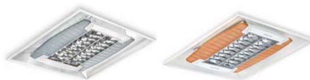
FBS 470/236 D6 (PW)

Exclusive direct-indirect decorative efficient luminaire suitable for modular ceiling system and suitable for lamp 2 X PL-L 36 W compact fluorescent lamp.