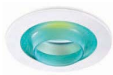
Aqua cover reversible

Circular recessed mounted downlighter with high efficiency optics and option of multiple attachments suitable for PL-C13W / PL-C18W lamps. FBH 145 family is superior engineered PL downlighter designed to deliver performance and flexibility in design and installation. The construction comprises of a sturdy PDC housing, Satin finish reflector enclosed gear compartment and a removable front frame enabling the use with a variety of decorative attachments. FBH 145 is available in two depths, 100mm and 65mm.