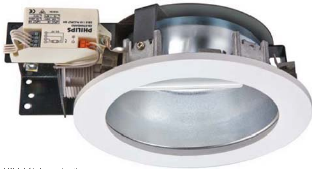
FBH 145 Low depth