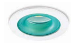
Cross Louvre Aqua